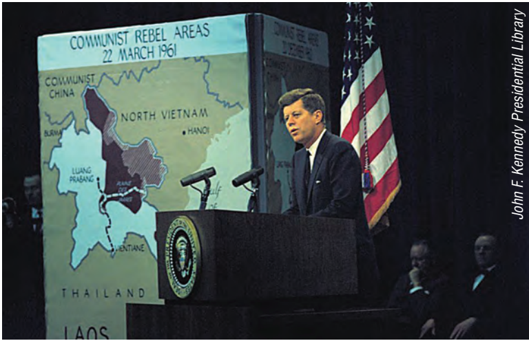
President Kennedy discusses Laos during a press conference at the State Department in 1961.