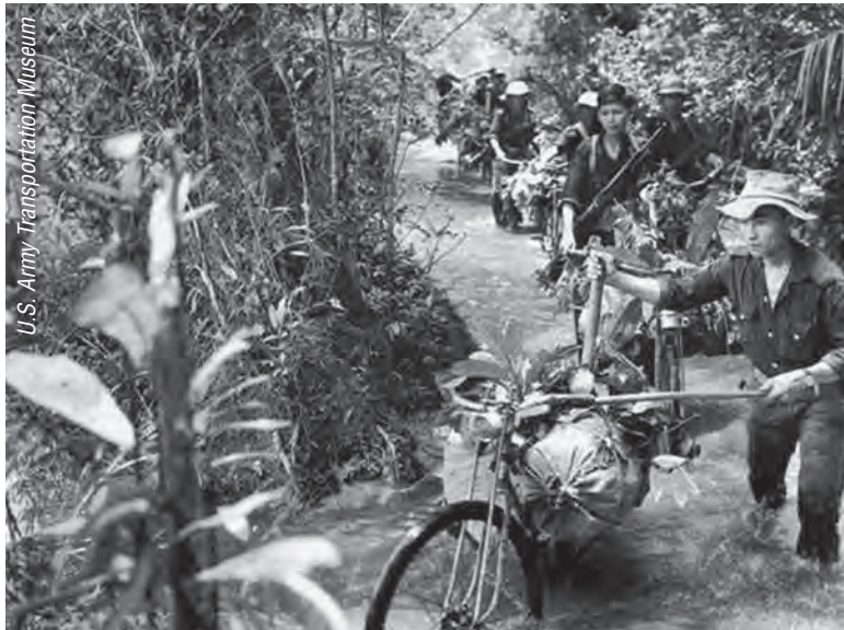
U.S. Army Transportation Museum

Bicycles are used to transport supplies down the Ho Chi Minh Trail.