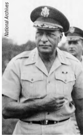
General Paul D. Harkins

Harkins’ task, like that of the MAAG under McGarr, was “to assist and support the government of Vietnam in its efforts to provide for its internal security, defeat Communist insurgency, and resist overt aggression.” However, he was not in a position, anymore than previous advisers, to dictate to the South Vietnamese. He had to use the American aid programs as leverage to achieve military and political goals. Still, Harkins would enjoy advantages that McGarr had not. In addition to exercising operational command over the growing swell of U.S. soldiers and units that were flooding into Vietnam as part of Operation BEEF-UP, Harkins had authority to coordinate all U.S. military intelligence activities in South Vietnam, an important asset in a war of shadows. As the commander of a subordinate unified command under Pacific Command, he also had direct access not just to its commander, Admiral Harry D. Felt, but to the Joint Chiefs of Staff and the secretary of defense. Last but not least, in recognition of the increasingly important role of