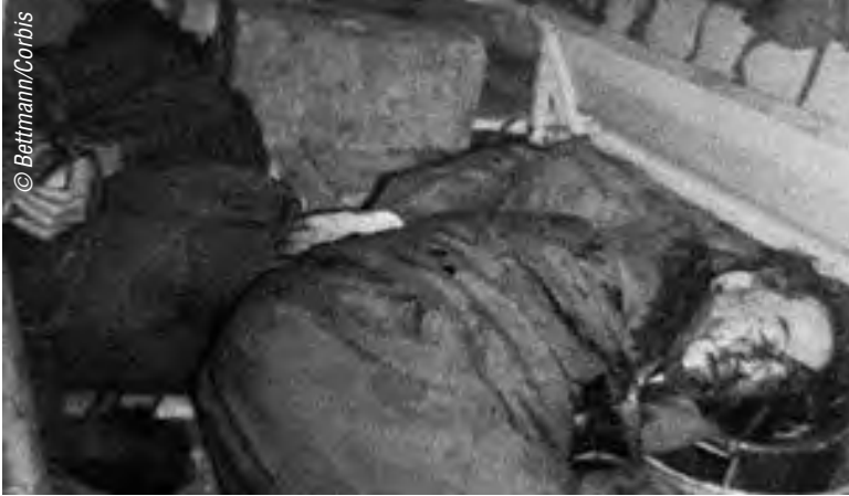
The bodies of Diem ( right ) and Nhu lie in an armored personnel carrier shortly after they were killed on 2 November 1963.

ment and personnel followed over the next year. This led to near paralysis in government programs in the countryside and to continuing ineffectiveness of the military. Diem, for all his faults, was an unquestioned patriot who had succeeded in maintaining control and creating a functioning—if inefficient—regime. His removal created a crippling vacuum that no one seemed able to fill.