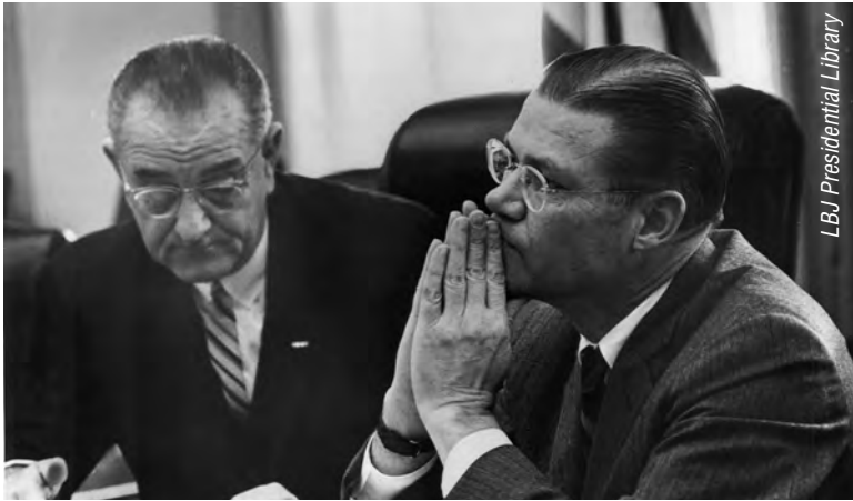
President Johnson and Secretary McNamara confer at the White House in 1964.

Ambassador Lodge. Desiring a unified team, on 25 April 1964, President Johnson announced that Harkins' deputy, Lt. Gen. William C. Westmoreland, would soon replace General Harkins as commander of MACV. The Pentagon recalled Harkins almost immediately, with Westmoreland serving as acting commander until 1 August when he formally assumed command and pinned on his fourth star.