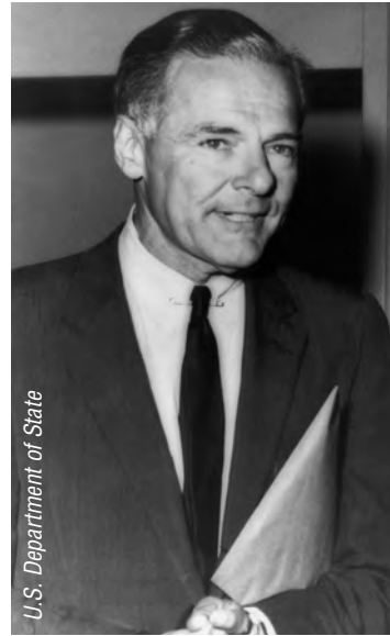
Henry Cabot Lodge

Over the next few months, senior U.S. policymakers debated the pros and cons of supporting the coup plotters. A number hoped to use the threat of a coup to force Diem to distance himself from Nhu and repudiate his policy of confrontation with the Buddhists. Others wanted to give the plotters a green light to overthrow Diem without overt American assistance. This would keep U.S. hands “clean” and might lead to a new and more popular government. Ambassador Lodge, who favored Diem’s ouster, and General Harkins held opposite views, and relations between the two quickly soured. In the end, covert assurances by certain State Department and CIA officials that the United States would not oppose a coup led to the generals moving against Diem on 1 November 1963. By the next day, the rebels had captured the palace and murdered Diem and Nhu. The generals established a provisional government on 4 November consisting of a Military Revolutionary Council with General Minh as chief of state and a mixed civilian-military cabinet.