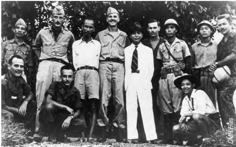
Ho Chi Minh ( standing, third from left ) at a farewell party for the OSS in 1945

With the Japanese surrender in September 1945, the United States pushed for, and achieved, the movement of a Chinese corps into northern Vietnam to disarm the Japanese while the British Army performed a corresponding mission in the half of the country below the 16th Parallel. Members of the U.S. Office of Strategic Services (OSS), some of whom had parachuted into northern Vietnam to work with the French forces retreating from Japanese attacks in early 1945, worked with the Chinese to attempt to recover Allied prisoners and disarm the Japanese. Other OSS personnel had joined members of the native Vietnamese resistance movement against the Japanese known as the Viet Nam Doc Lap Dong Minh Hoi , or Viet Minh, led by a dynamic Communist who called himself Ho Chi Minh. The United States found itself caught between the Viet Minh, with links to the Communist international movement, and its French allies who were intent on re-establishing their hold over the colony. Both sides took advantage of the