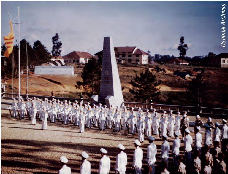
Cadets at the Da Lat Military Academy

training school at Nha Trang where some of the early training teams from the U.S. Army Special Forces conducted their first missions in Vietnam. Special Forces provided a critical component of training to the South Vietnamese armed forces.