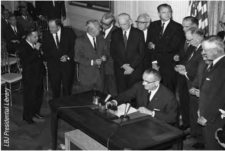
President Johnson signs the Tonkin Gulf Resolution on 10 August 1964.

that night in the summer of 1964 although the attacks on 2 August were quite real. However, Washington policymakers believed the North Vietnamese had attacked U.S. destroyers again and were determined to do something about it.