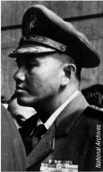
Maj. Gen. Duong Van Minh