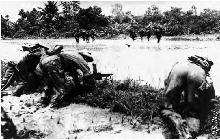
French machine gunners have just enough time to throw themselves on the ground and put their weapon in play as Viet Minh soldiers attack.

implement grand plans with its limited resources and decreasing support from its government and people.