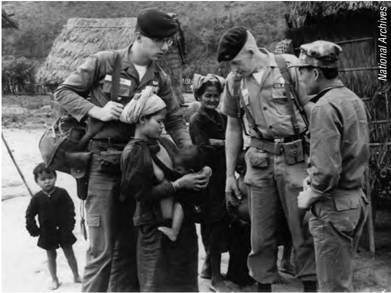
Special Forces medics check a Montagnard baby as part of the Civilian Irregular Defense Group program in 1963.

same model until 200 villages were included and 60,000 people were effectively being protected from Viet Cong attacks and thus were counted as being in support of the government. By September 1962, the program was so large and absorbed so many military resources that the Kennedy administration transferred it from CIA to Army control in what was called Operation SWITCHBACK. The Army activated a new headquarters in Saigon (later moved to Nha Trang), U.S. Army Special Forces (Provisional), and gave it control over the twenty-four Special Forces detachments in the country, many of which were engaged in what was now called the Civilian Irregular Defense Group (CIDG) project ( Map 4 ).