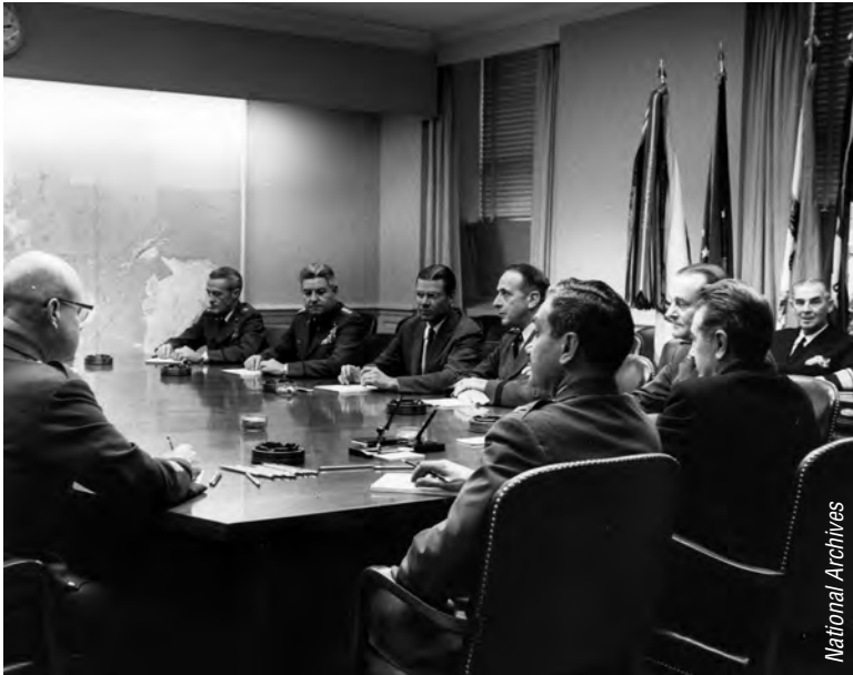
Secretary of Defense McNamara ( seated, fourth from the left ) meets with members of the Joint Chiefs of Staff at the Pentagon in 1961.