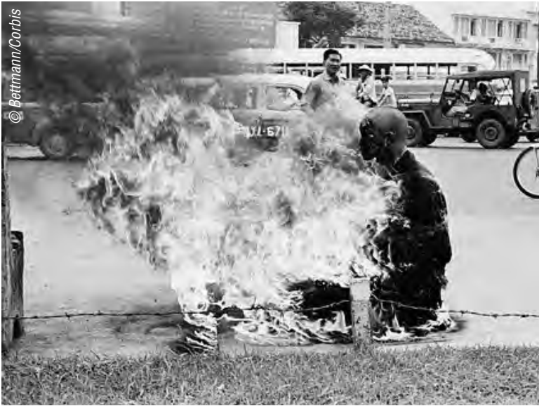
A young Buddhist monk performs a ritual suicide, by self-immolation, in the central market square of Saigon on 5 October 1963.

a series of raids against Buddhist pagodas. The United States began to lose faith in the ability of Diem to rule his own people, let alone conduct vigorous operations against the Viet Cong insurgents.