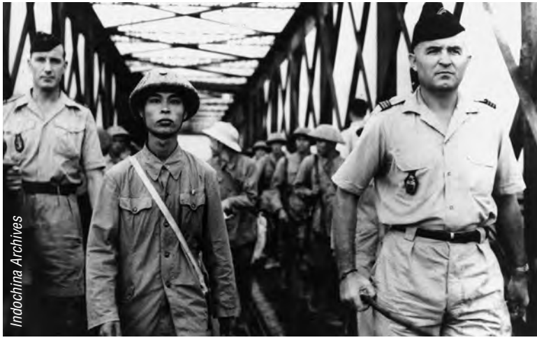
French soldiers escort Viet Minh into Hanoi, October 1954

Commission consisting of representatives of India, Poland, and Canada, and free elections were to be held in North and South Vietnam in July 1956. The United States did not concur in the final declaration but pledged to “refrain from the threat of the use of force to disturb” the agreements while warning that it would not stand idly by at any renewal of attacks in violation of the agreements. The outcome was nothing less than a major defeat for France, the United States, and the free world. The Geneva Agreements ceded half the country to Ho Chi Minh’s Communist-controlled Democratic Republic of Vietnam, with its capital in Hanoi. This left South Vietnam under the weak remnant of a government headed by the last Vietnamese emperor Bao Dai and his new prime minister, Ngo Dinh Diem, with its capital in Saigon.