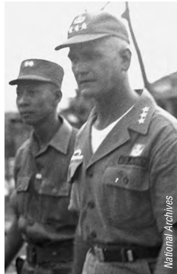
General Westmoreland tours the village of Vam Lang in May 1964.

General Westmoreland was an experienced and decorated combat commander from World War II. He had transferred to airborne troops after the war and commanded the 101st Airborne Division, served as superintendent of the United States Military Academy at West Point, and commanded the XVIII Airborne Corps. He seemed ideal for the position, combining combat experience,