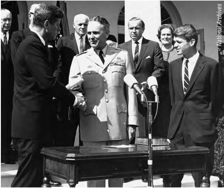
General Taylor ( center ), with President Kennedy and Attorney General Robert F. Kennedy, during his swearing in as chairman of the Joint Chiefs of Staff on 1 October 1962

centralization, and nepotism. The mission also recommended more U.S. civilian and military advisers throughout the government of South Vietnam along with additional communications and support personnel. President Kennedy accepted the recommendation but rejected a further suggestion that he send eight thousand combat troops into the embattled Mekong Delta. Diem opposed many of the proposed reforms, arguing that they were either unnecessary, unrealistic, or would have the effect of turning South Vietnam into a protectorate of the United States. Vietnamese pride and American caution thus slowed the pace of U.S. involvement, but regardless of concerns on both sides, on 4 January 1962, a new partnership between the two countries was announced.