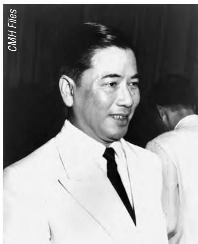
South Vietnamese President Ngo Dinh Diem

intervention), founded on the simple fact that the Eisenhower administration did not have the money or the forces to pursue a policy that had so little chance of success. Yet the impulse to oppose the further expansion of Communist influence in Asia was powerful. What, then, was the United States to do now?