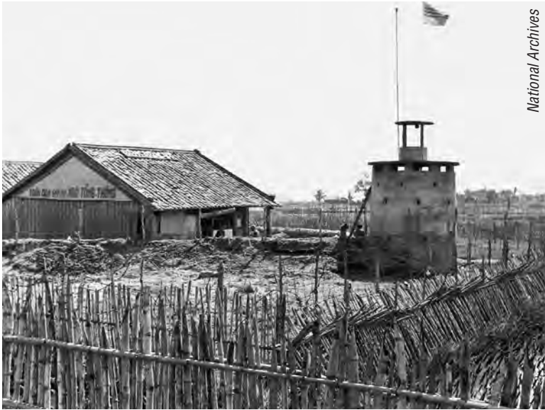
A strategic hamlet in Long An Province in 1963

learned in their successful counterinsurgency campaign in Malaya. Sir Robert Thompson, head of the British advisory mission to Vietnam, had been one of the planners of that campaign and provided advice on the importance of rural security in isolating an enemy guerrilla force. Unfortunately, rather than building the hamlets slowly outward from a central, expanding base, Diem tried to build thousands almost simultaneously throughout the country with insufficient plans to link them together for security purposes. He hoped to complete seven thousand strategic hamlets by early 1963 and another five thousand by the following year. However, the program again uprooted farmers and their families and the government's development and security aid often proved inadequate. Therefore, the program was only partly successful.