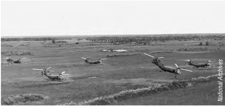
H-21 "Flying Banana" helicopters unload South Vietnamese soldiers in 1962.